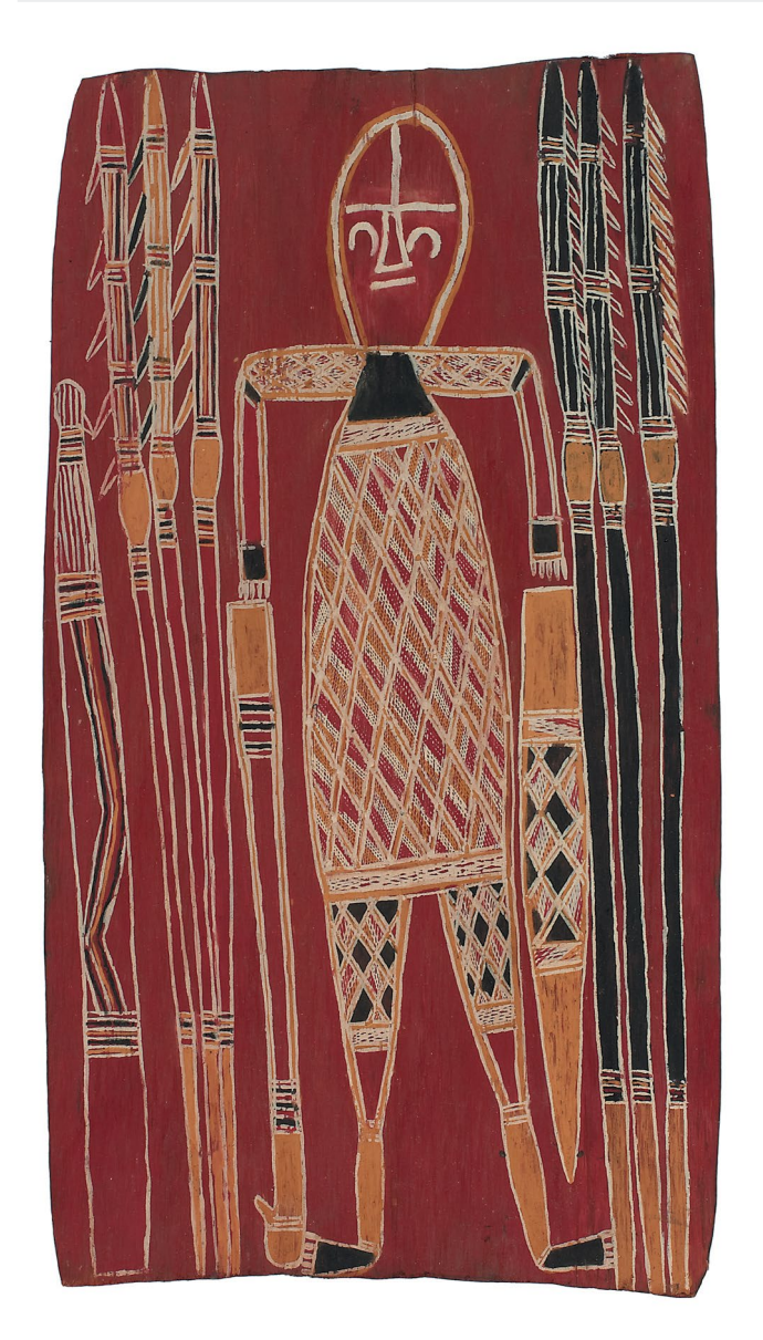
Figure 9.4 Murayana by Djäwa Daygurrgurr.