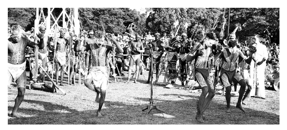
Figure 9.6 Arnhem Land dancers performing for Queen Elizabeth II and the Duke of Edinburgh at Toowoomba, 1954.

Source: Courtesy National Archives of Australia, A1773, RV1105.