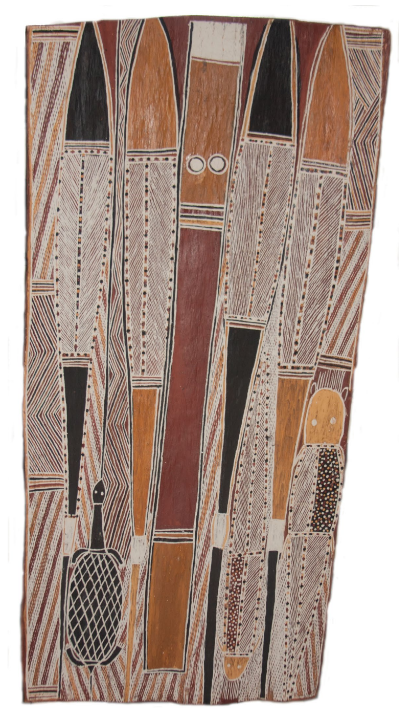
Figure 9.11 Burala Rite by Djäwa Daygurrgurr, 1972, collected by Ed Ruhe at Milingimbi.

1993.0004.865.