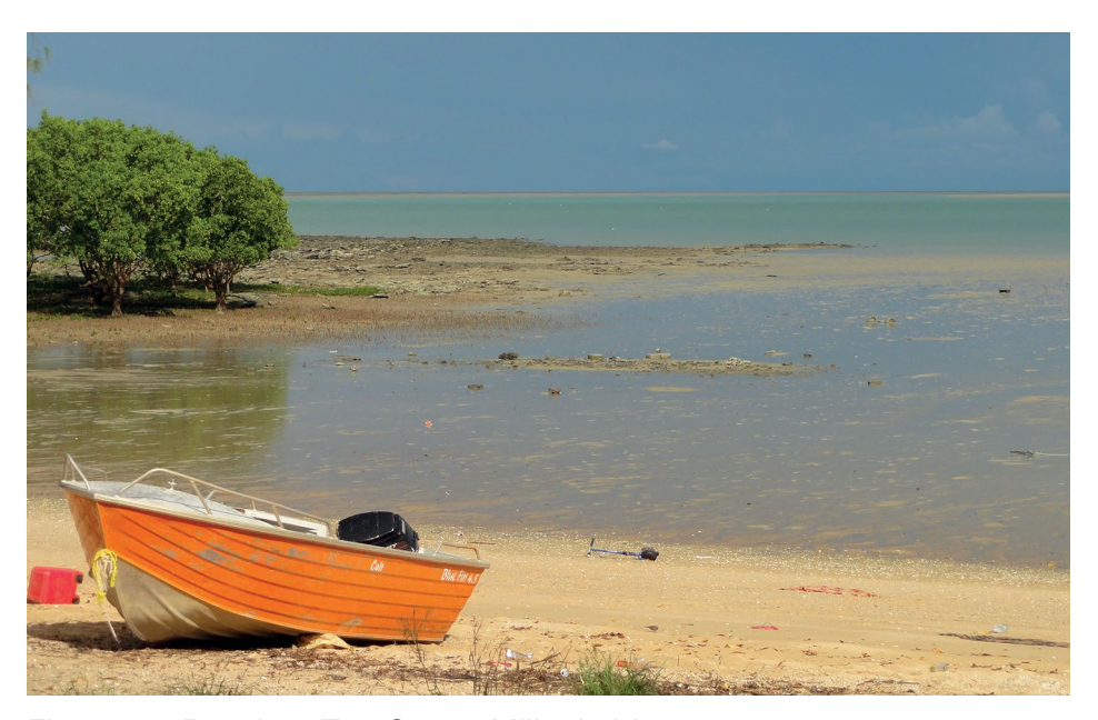
Figure 9.2 Beach at Top Camp, Milingimbi, 2013.

Milingimbi was a centre for Macassan trepang gatherers because of its permanent waterhole and fine beach. For similar reasons Milingimbi was a ceremonial centre for the Yolngu; several hundred could gather at the permanent waterhole towards the end of the dry season to exploit the abundant cycad-palm nuts in the forest, and rush-corms and long-necked turtles from the plains and lakes. (Keen 1978: 16)